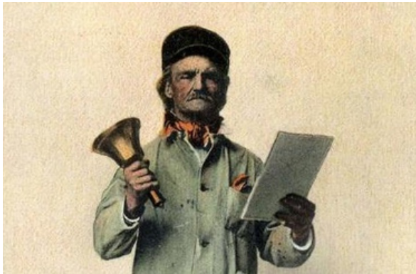
By Unknown author - postcard. Public Domain.